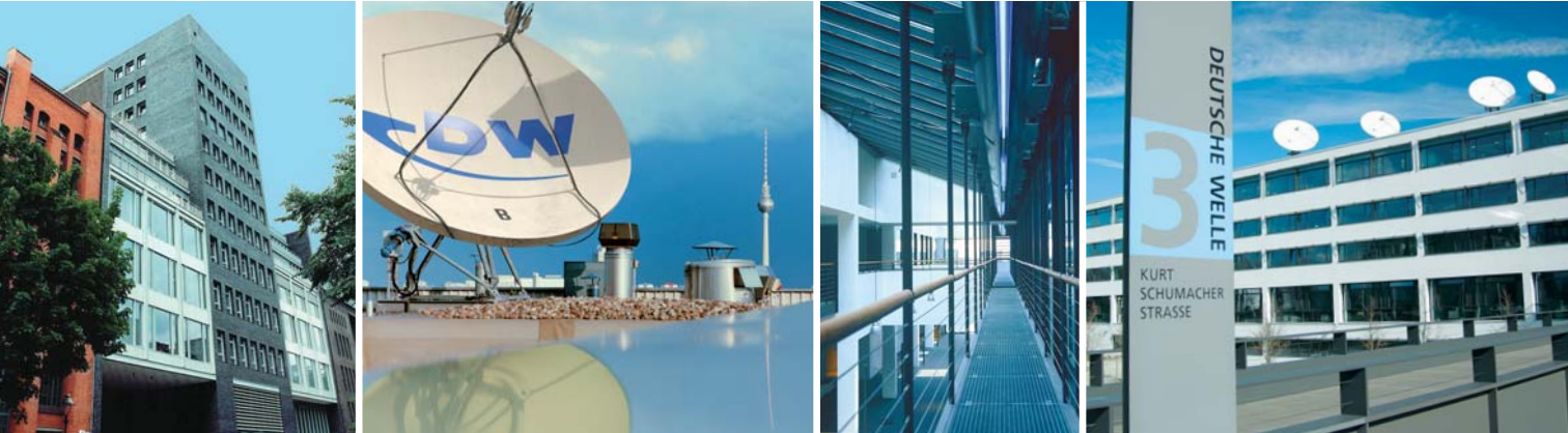
Deutsche Welle broadcasting centres in Berlin (left) and Bonn