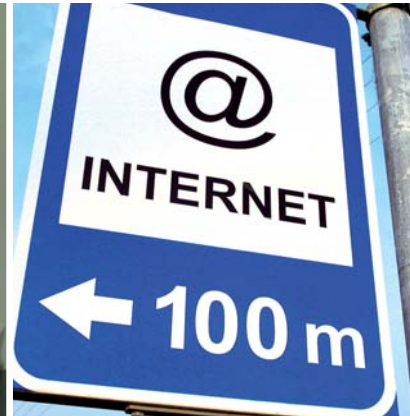
DW-WORLD.DE promotes dialogue - with budding scientists on “Study in Germany” and users in the Arab world.