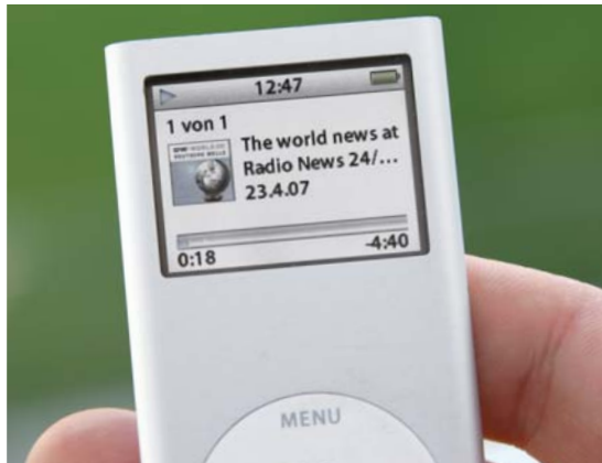
Mobile services in 8 languages: DW-WORLD.DE via cell-phone, pocket-PC, PDA or MP3-Player